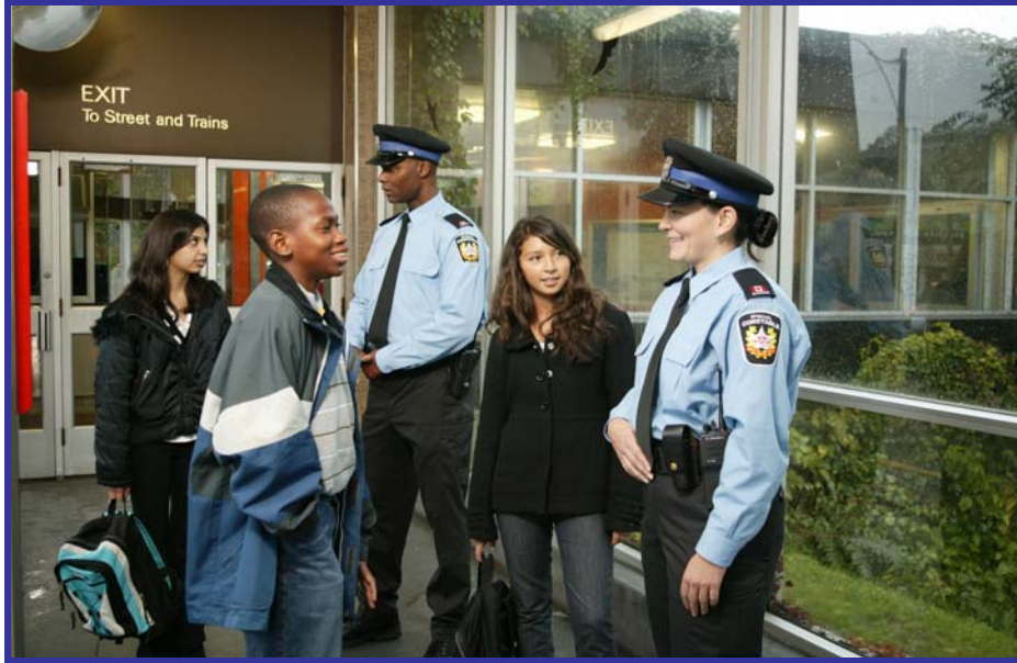
COMMUNITY AND SAFETY PARTNERS