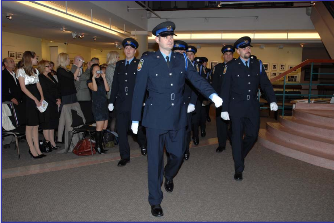
2008 RECRUIT GRADUATION