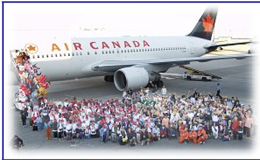
READY FOR TAKE OFF 2008

In 2008, the Special Constable Services team (Dream Makers) raised in excess of $4,600 for the Dreams Take Flight program and received an appreciation award for their support and contributions.