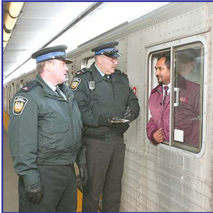
TRANSIT SPECIAL CONSTABLES LIAISING WITH TTC SUBWAY EMPLOYEE

Transit Special Constables provide effective law enforcement and security services consistent with the business needs of the Toronto Transit Commission in partnership with the York Regional Police Service and the Regional Municipality of York Police Services Board.