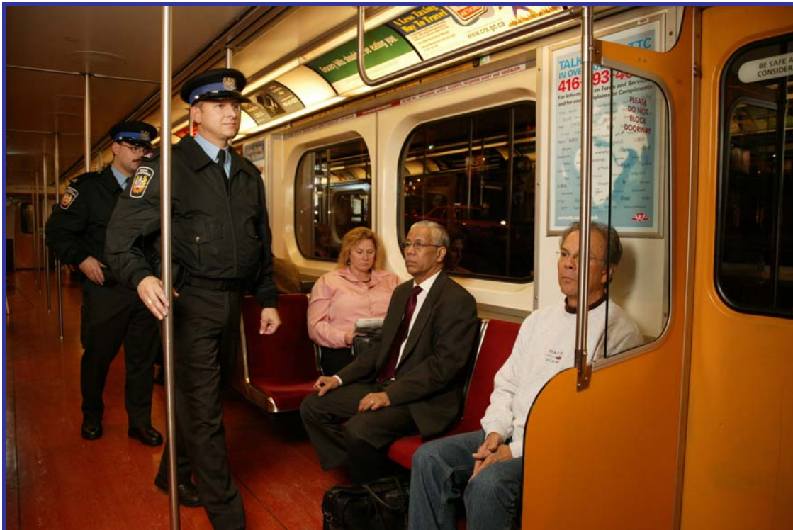
TRANSIT SPECIAL CONSTABLES OF FOOT PATROL