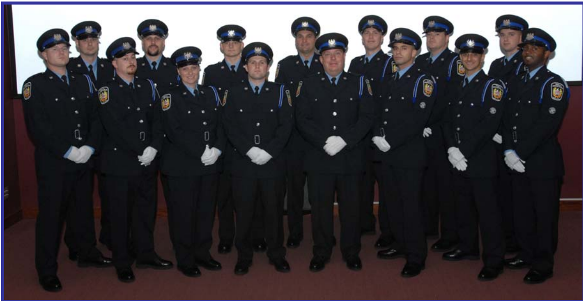
2008 GRADUATING CLASS

Failure to meet the minimum requirements of the prescribed recruit training will result in the termination of employment.