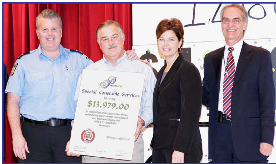
2008 TTC UNITED WAY FINALE

Benefiting the United Way of Greater Toronto, in 2008, the Special Constable Services United Way campaign raised a total of $13,979 towards the overall TTC achievement of $1,260,000. While personal contributions accounted for the majority of the total, members also participated in local departmental and corporate events such as barbecues, raffles, and the CN Tower stair climb.