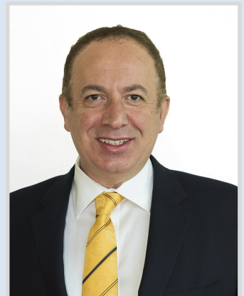
Mayor Maurizio Bevilacqua

The Board welcomed Mayor Maurizio Bevilacqua of the City of Vaughan at its October meeting. Mayor Bevilacqua was appointed to the Board by Regional Council and is currently serving his second term as Mayor. Mayor Bevilacqua was a Member of Parliament for 22 years and has served in several roles. He is currently the Vice Chair of York Region Rapid Transit Corporation, Chair of the Integration Committee for Alectra Inc., Co-chair of the Mackenzie Vaughan Hospital's $250 million Exceptional Care Belongs Here Campaign and is a member of the Board of Directors at Versa Bank. He serves on a number of local boards including the Advisory Council for the Certificate in Business Administration for the School of Continuing Studies at York University and is a member of the Global City Leaders Advisory Board for the World Council on City Data. Click here for full biography.